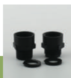
USA thread to Australian thread converter- K-BSP