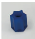
Old-Style Blue Connector (Pre-2016 caps)