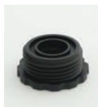
Hoselink - 20mm USA Thread Adapter