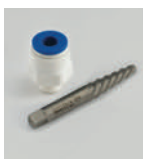
Steel Easy Out + Blue Disconnect