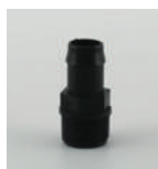
Director, 25 mm male BSP thread x 25mm LDPE