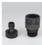
Quick Snap-On 13mm tap Connector Set, fits EZ-FLO hose tap adapter only