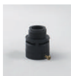
Vacuum breaker with US thread, fits EZ-FLO hose tap connector only