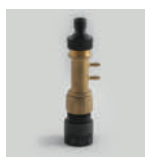
Hose tap connector, brass with 13mm snap on connectors