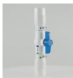
Ball Valve Coupling Connector 32mm BSP Female