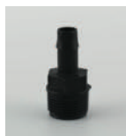
Director, 20mm male BSP thread x 13mm LDPE