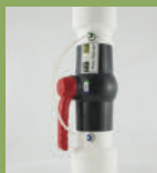
Coupling ball valve adapter to suit 100mm PVC, CBV400