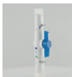
Ball Valve Coupling Connector 25mm BSP Female