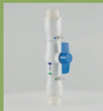
Ball Valve Coupling Connector 32mm BSP Male