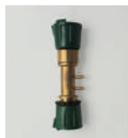
EZFLO tap adapter with Hoselink fittings (USA thread converted)