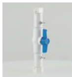
Ball Valve Coupling Connector 20mm BSP Female