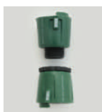
Hoselink 20mm USA Converter for EZ-FLO Tap Adapter