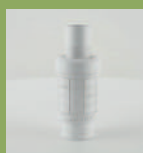
Telescopic PVC slip fix coupling 1"