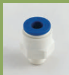
Blue Disconnect PCB