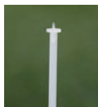
Dip Tube Set