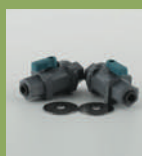
Heavy duty Shut Off valves, SOV