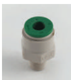
Green Disconnect PCG