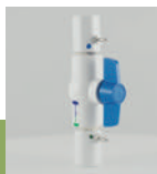
Ball Valve Coupling Connector 25mm socket