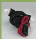
EZ-FLO ultra Low-Flow Solenoid