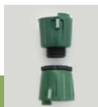
Hoselink 20mm USA Converter for EZ-FLO Tap Adapter