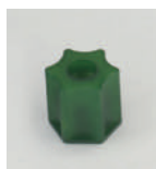
Old-Style Green Connector (Pre-2016 caps)