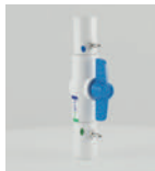
Ball Valve Coupling Connector 20mm socket