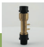
Hose tap connector, brass with 20mm thread connectors in lieu of 13mm snap on connectors