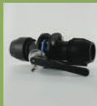
Wafer Valve Adapter to suit 75mm Poly complete, code CWV75