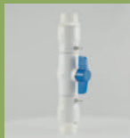
Ball Valve Coupling Connector 40mm BSP Male