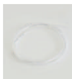
Clear tube CT5