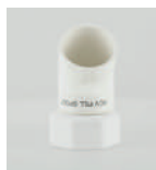
Filling spout to suit HCV systems, part of large funnel