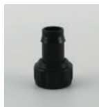
Director, female 20mm BSP thread x 20mm LDPE