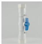
Ball Valve Coupling Connector 40mm BSP Female