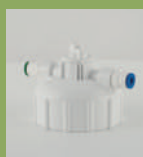
Replacement Cap, MBT