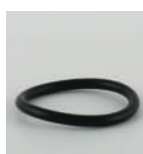
Large O-ring K-LOR