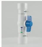
Ball Valve Coupling Connector 50mm socket