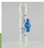
Ball Valve Coupling Connector 50mm BSP Male