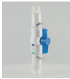
Ball Valve Coupling Connector 25mm BSP Male