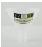
Broad mouth funnel EZ-FNLSC