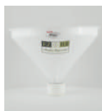
Large funnel to suit HC and HCV systems, code EZ-FNLHC