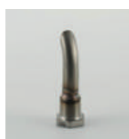
Injection probe adapter, 3/8" to suit water end, code K-SVF 23