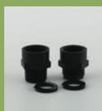
USA thread to Australian thread converter- K-BSP