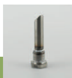
Injection probe adapter, 3/8" to suit fertiliser end, code K-SVF 23