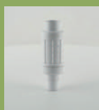
Telescopic PVC slip fix coupling 3/4"