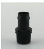
Director, male 20mm BSP Thread x 20mm LDPE