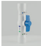
Ball Valve Coupling Connector 32mm socket