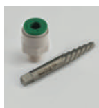
Steel Easy Out + Green Disconnect