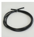
Black tube BT5