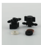
FLO discs, LDSOV-FLO