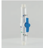
Ball Valve Coupling Connector 20mm BSP Male