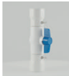
Ball Valve Coupling Connector 40mm socket