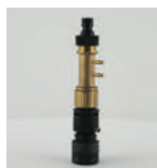
Hose tap connector, brass with 13mm snap on connectors and vacuum breaker