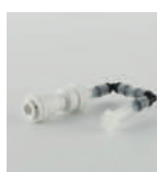
Liquid converter kit, K-LDT QDV