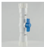
Ball Valve Coupling Connector 50mm BSP Female