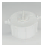
Old-Style Cap (Earlier FX Mainline Models)