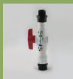
Hose tap connector 20mm, with ball valve and BSP fittings, 3060BV (BSP)